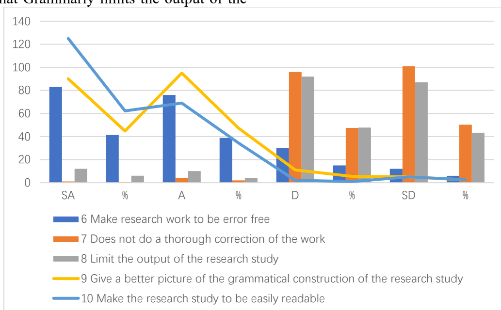
FIGURE 2: GRAMMARLY PLAGIARISM CHECKER, IN BUILDING QUALITY IN RESEARCH PRACTICES AMONG GRADUATE STUDENTS.

research study 92 (47.76) strongly disagree while only 10 (3.99) strongly agree. Similarly, 90 (44.78%) of the total respondent strongly agree that Grammarly gives a better picture of the grammatical construction of the research study with only 5 (2.49%). Finally, 125 (62.19%) strongly disagree that Grammarly makes the research study to be easily readable with only 2 (0.99%) saying that Grammarly makes the research study to be easily readable. The results are graphically presented in figure 2.